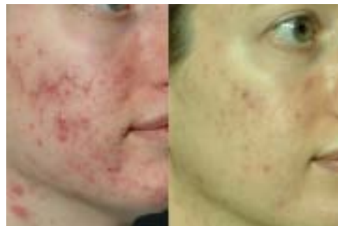
3 treatments with the Blu-U and ALA, with 3 weeks in between each treatment

ridges. Follow this with the Blue Light. After treatment patients may experience some temporary reddening. Some patients experience minimal swelling in the treated area. Generally the redness subsides 4 weeks after treatment and swelling dissipates after 1-2 days. The therapeutic effect occurs as early as four weeks after treatment, compared to eight to twelve weeks after drug therapy. Schedule your consultation with Aesthetic Solutions today! (919) 403-6200.