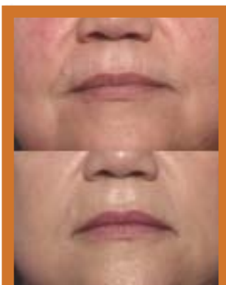
Before and After Restylane Injections

Purchase the first syringe at regular price, and get $100.00 off the price of the second syringe! Up to $100 cashback!